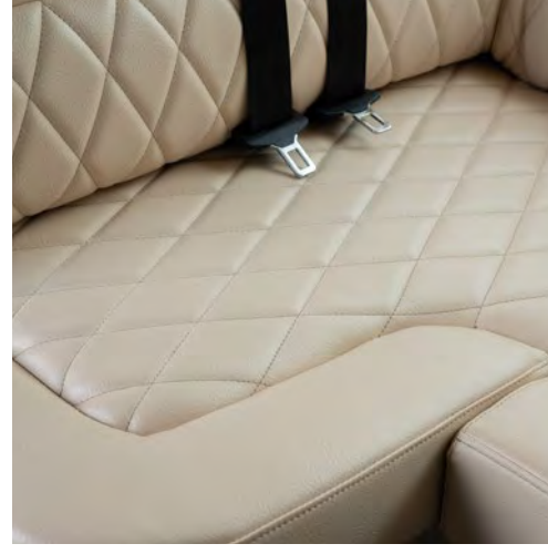
EMBROIDERED FAUX LEATHER